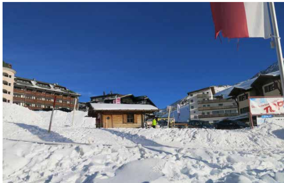
View from South West to apartments.