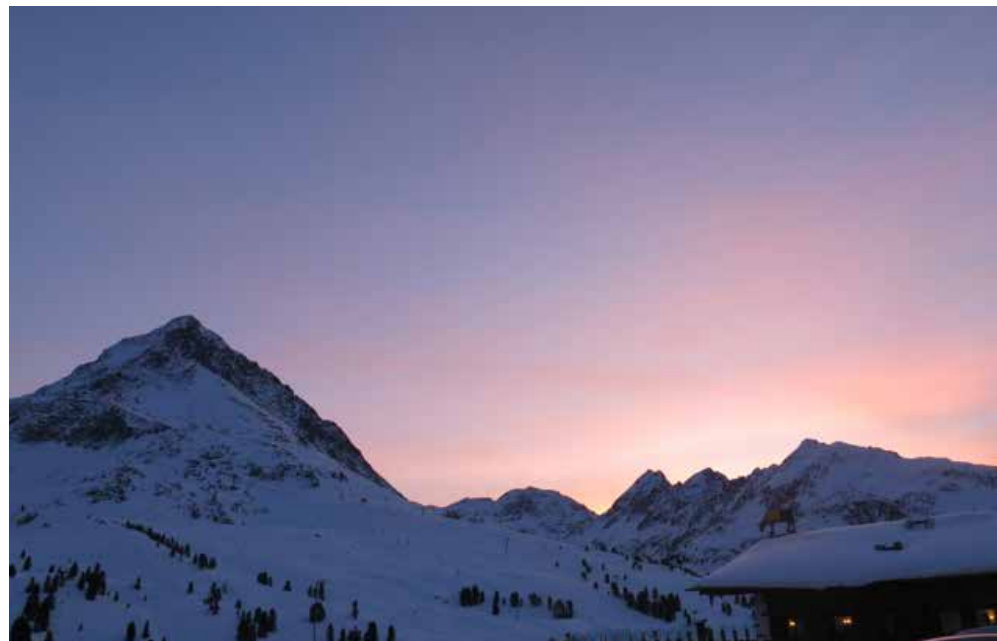
View South West at sunset.