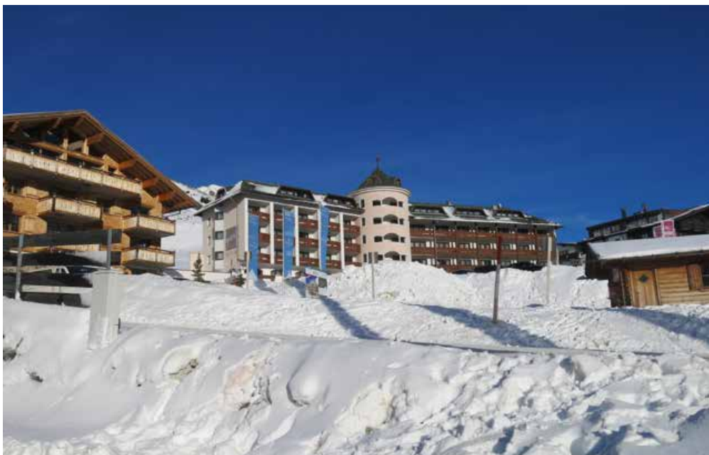
View from South West to apartments.