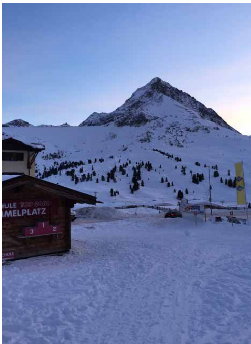
View South West at sunset.