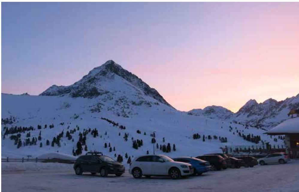
View South West at sunset.