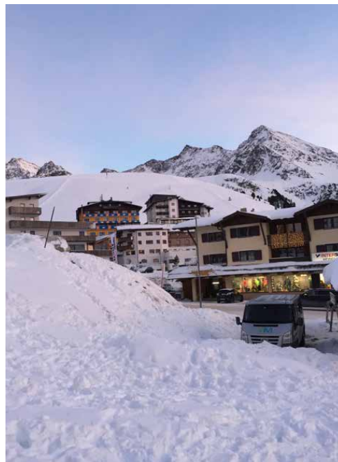
View East from apartments