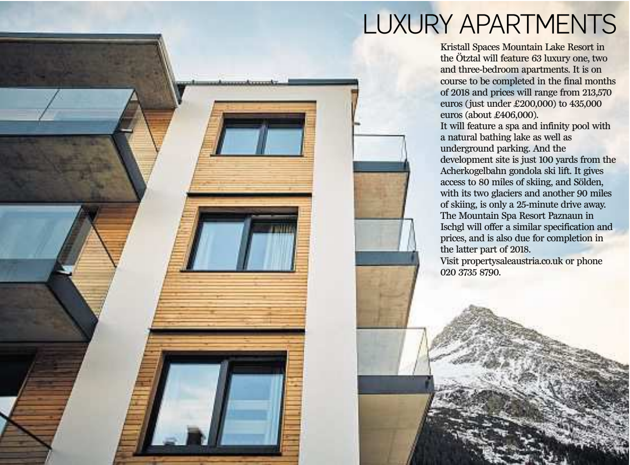
The exterior of the new Mountain Lake Resort

with it. I'm glad I ddn't try the frankly terrifying looking aerial zipline, or, for that matter, the equally panic-inducing megaswing. Those who did looked like they were having a good time. I think. Europe's largest outdoor extreme water sports park also offers rafting, canyoning and caving. Visit www.area47.at/en